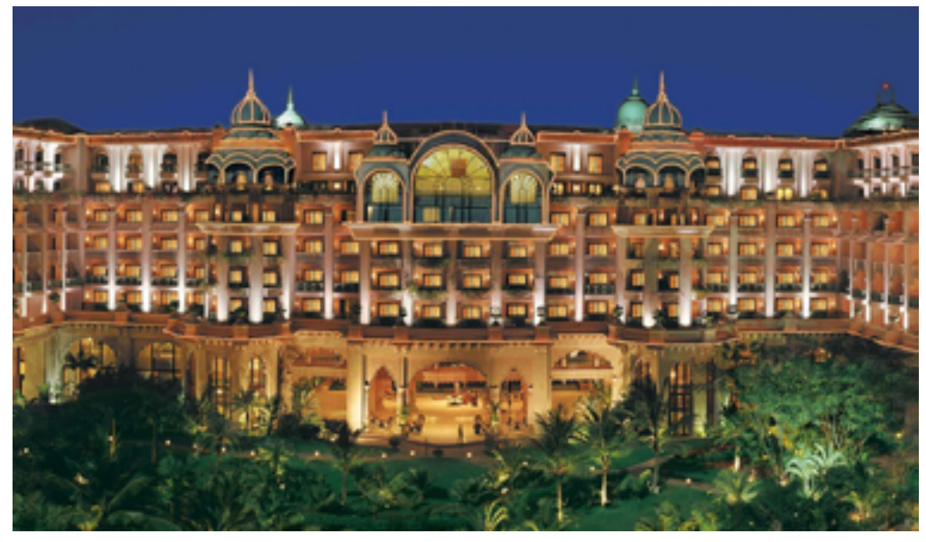
The Leela Palace Bangalore - 2015 AIB Conference Venue

As with the submission of papers, signing up to serve as a reviewer will be managed on the web To volunteer as a reviewer, please fill out the form at: http://meetings.aib.msu.edu/aib/2015/signup.php. Remember, you will have to identify the track(s) for which you would like to review papers. Descriptions of this year's tracks and identifying keywords and phrases can be found in the paper call; please see above webpage for the detailed paper call.